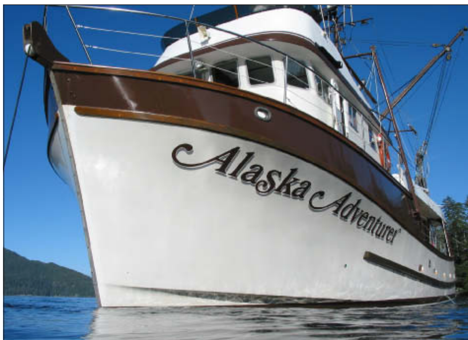
Kayak View of the M/V Alaska Adventurer