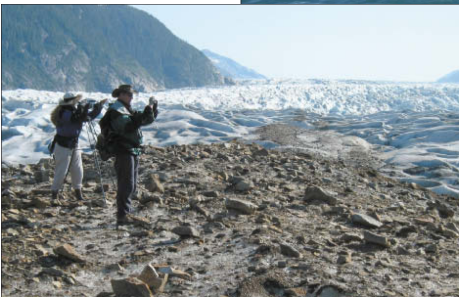
Capturing the Sights On Top of the Glacier.