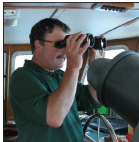
The Captain on Look-out

While at sea braving our wild winter weather, I thought often of this past summer's pleasurable trips. How do I capture my feelings in words? Deep gratitude. Summer. Wonderful people. Satisfaction. The rewards of this business are found in good times and adventures with our fantastic clientele. You can see