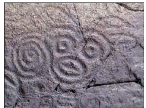
Ancient Petroglyph Rock Art Face.

ASA guests will work with the team for five days, recording rock art elements and site characteristics. We'll offer evening programs aboard the Alaska Adventurer and visit at least one of the recently discovered caves yielding significant paleontological information on North America's early inhabitants. We'll also offer evening paddle and beachcombing options, and guests