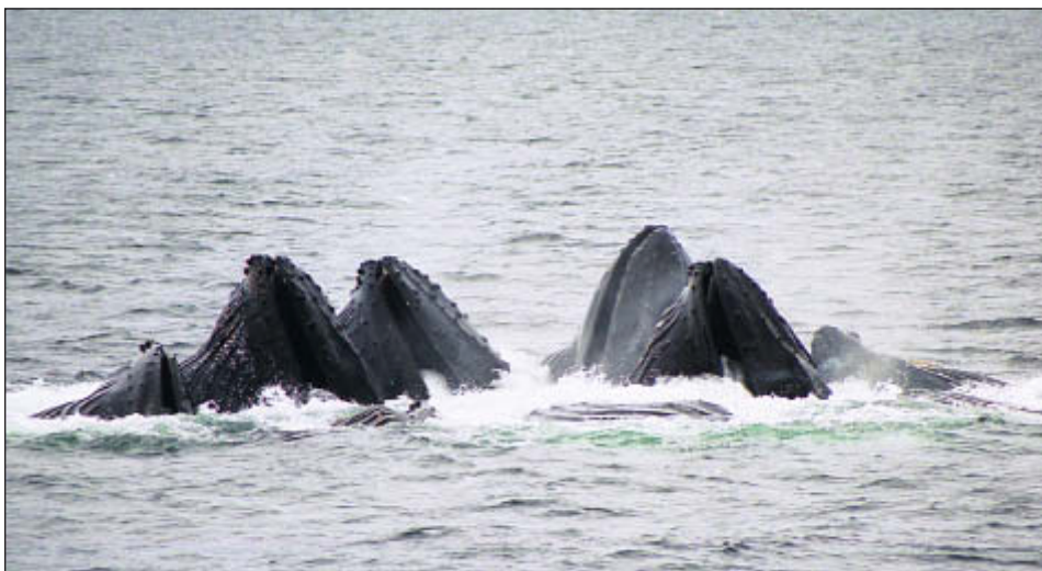
Amazing Humpback Whale "Bubble-net" feeding.

Southeast Alaska Photo Safari with Jodi Shepherd July 24 – 31, 2004 August 2 – 9, 2004