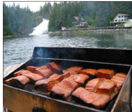
Fresh Salmon BBQ on Alder Planks