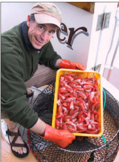
Fresh Prawns Tonight!