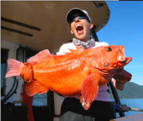
Yellow-Eye Rockfish Delight!

small group ready to relish the tranquility of anchoring in a new bay or cove every night, you'll find a yacht charter cruise with Alaska Sea Adventures just the right size. Flexibility, comfort, savoir-faire, our local knowledge, and personalized attention make your Alaska voyage unique.