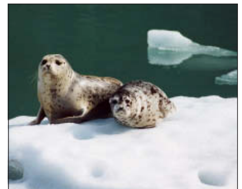
Harbor Seals on Ice.