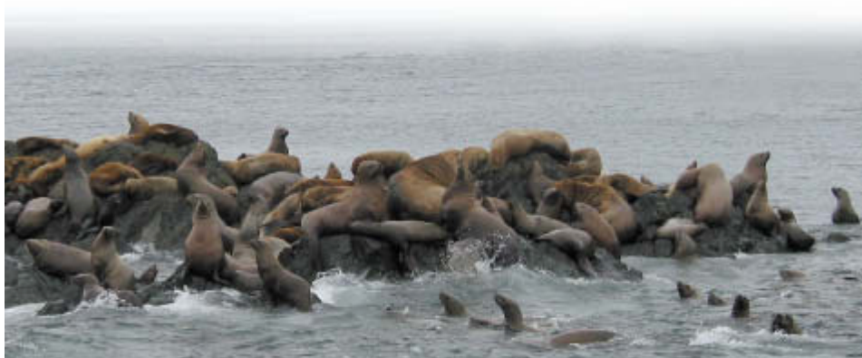
Stellar Sea Lion Raucous