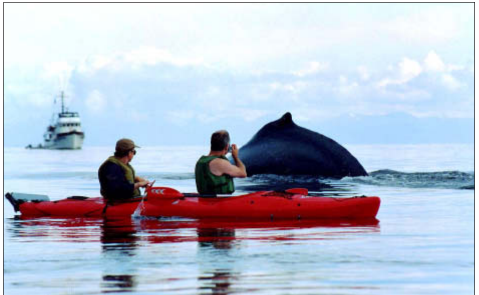
This is Up-Close!

Whether you're a seasoned pro or enthusiastic amateur, our guided trips feature wildlife and nature photo opportunities like no other place on earth! On these trips we always focus—pun intended!—on capturing the humpback whale's unique cooperative 'bubble net' feeding behavior. We've chosen optimum dates to observe, up-close, this phenomenon that occurs only in the waters of Frederick Sound and Chatham Strait. Seeing six to twenty of these ocean giants in choreography is absolutely stunning, even if you aren't gripping a camera. To quote one of our photo