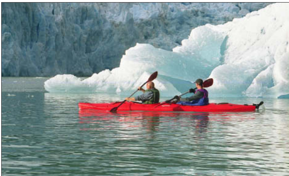
An Afternoon Ice Berg Paddle.