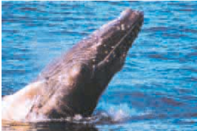
Spy hopping humpback

Adventure's schedule of events and early planning. We hope this may help you obtain a front row seat to a real Alaskan adventure presented with precious local knowledge in one of the earth's most beautiful natural arenas. We specialize in creating custom cruises based on each particular group's interest. Bring us your ideas and let's sit down in the chart room and plan a voyage like no other. As always, Alaska Sea Adventures has the regional advantage of being a true locally owned and operated company and we're very proud to share 'our' Alaska with you!