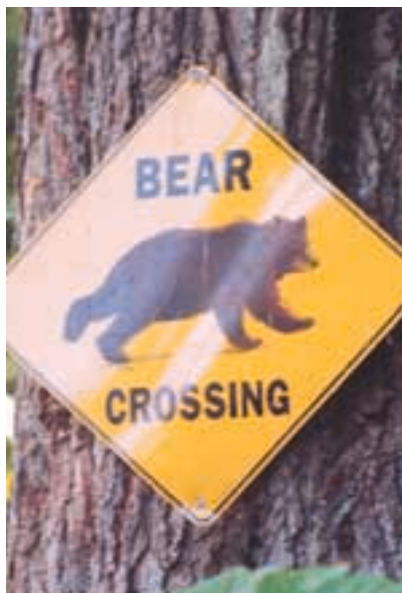
Alaska traffic sign

our observations and adventures. We all walked away with great memories and new friends. From the perspective of a naturalist/guide, the trip couldn't have been much better