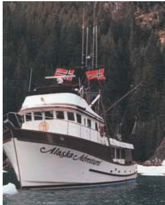
M/V Alaska Adventurer

Once again Alaska Sea Adventures is proud to offer a super selection of exciting guided expeditions with some of the best guides available. We are very fortunate to have access to a host of professional guides in a large variety of activities and interests, enabling us to create a customized