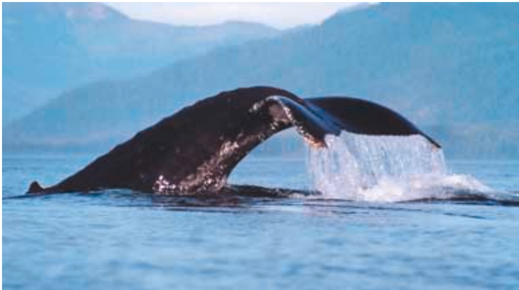
Dripping jewels