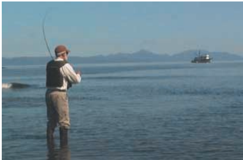
Salmon flyfishing afternoon

Following our exploratory adventure we'll continue to sample Southeast Alaska's spring steelhead runs as we sail northward, stopping to fish estuary systems and nameless bays for mint bright steelhead along the way. Steelhead in our local waters run 8 to 16 pounds with an average of 12-pound. Generally speaking, most of our steelhead fishing closely resembles New Zealand's trophy trout fishing, where watersheds flow gin clear from steep rain forest canyons laced with tumbled down trees. There's walking and stalking involved and sight casting to personal pods or solitary fish are more the rule than the exception. These trips offer fly rodders some of the best opportunities in North America to intercept these magnificent and