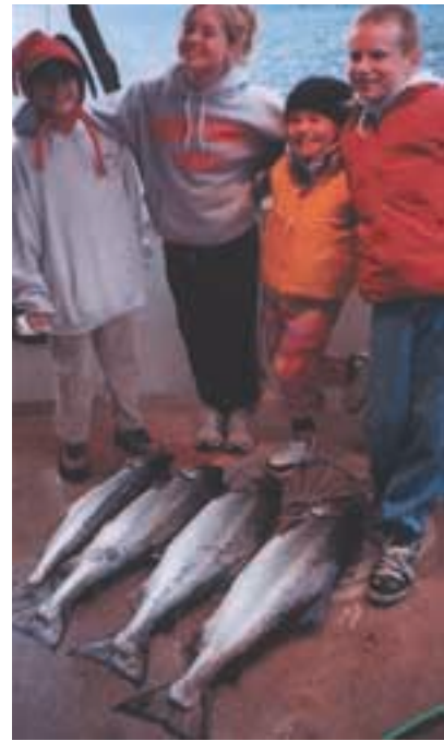
Kids and Kings

I derive a lot of pleasure performing the research for these trips and working with guides to formulate a unique experience for our clients. It also continually reminds me of what a special place Southeast Alaska is with all of its diverse beauty and rich heritage. It is through this realization that I understand why I have such a deep passion and appreciation for this area. Not only do I gain a greater personal knowledge of Southeast Alaska researching the information for a specific trip, I am enhanced with local knowledge that I will be able to share on each voyage the Alaska Adventurer embarks upon. I also think it's a lot of fun to work with our groups creating a custom trip that encompasses all of the interests of the group and as many wonders of the