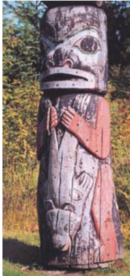
Kake Totem