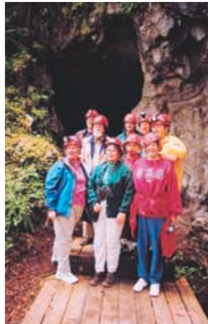
El Capitan Cavers

Our steelhead season begins with a trip for anglers who desire (or insist on) absolute adventure. Entirely exploratory, this expedition will highlight a first hand look at some of North America's last, unspoiled, wild steelhead systems. We'll explore and fish several remote estuaries and bays along the outer reaches of the South Prince of Wales Island Wilderness, a cluster of islands just north of the