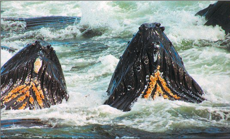
Humpback whales bubble-net feeding up close