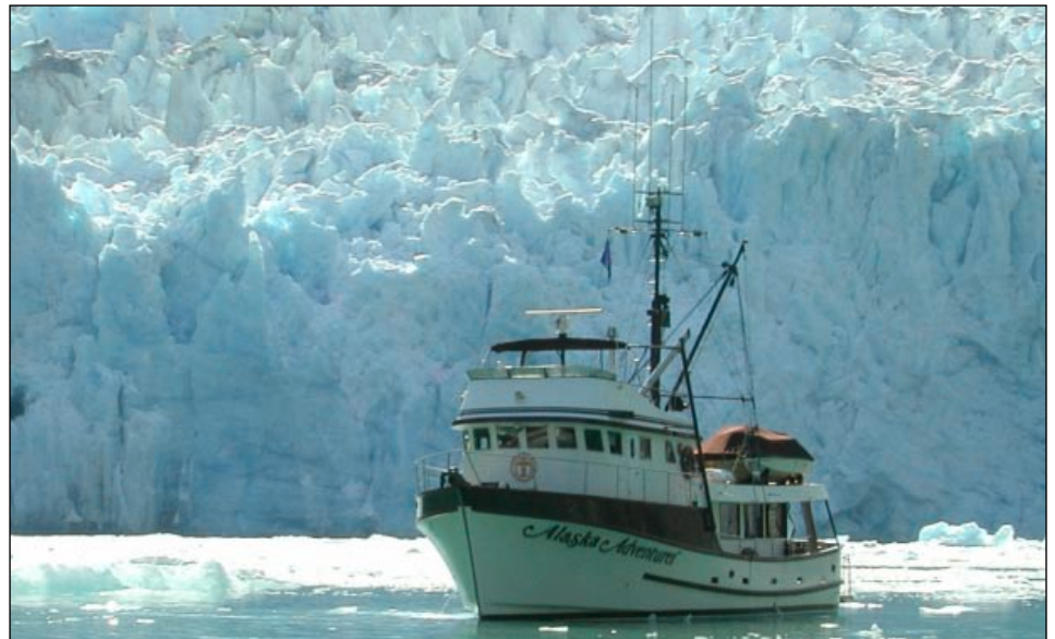
M/V Alaska Adventurer in Tracy Arm, Sawyer Glacier

Another winter has nearly passed as we look with eager anticipation to the arrival of spring and the annual heralded events that unfold every summer among the majestic islands of the Alexander Archipelago that form Alaska's Inside Passage. Southeast Alaska is a very special, unique land with seasonal splendors that seem magical and never cease to amaze the most seasoned travelers to this mystical realm. Bears awaken from a winter's slumber with the prospects of a spring and summer resplendent with a rich bounty of meadow grasses, tubers, berries and streams choked with salmon. Whales return from a winter long fast in Hawaiian waters for a summer of gorging in the plankton and herring rich waters of the protected island passes. The amazing spectacle of tens of millions of salmon returning to their streams and rivers of origin to complete an important cycle of life that the region depends and sustains itself upon. And