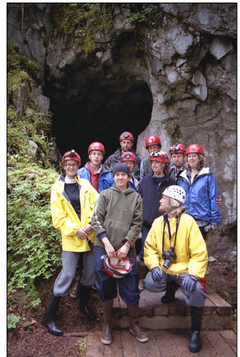
El Capitan cave explorers 2002

There is a lot more information about our trips. Visit our web site or give us a call today.