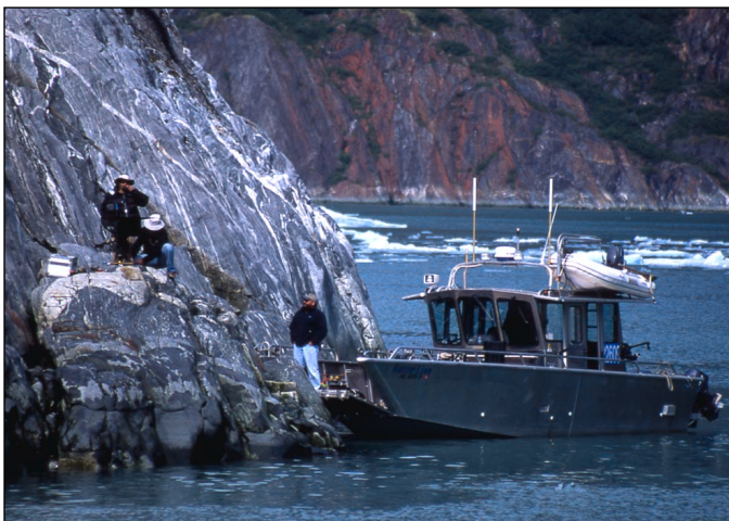
Amex commercial film crew, Tracy Arm