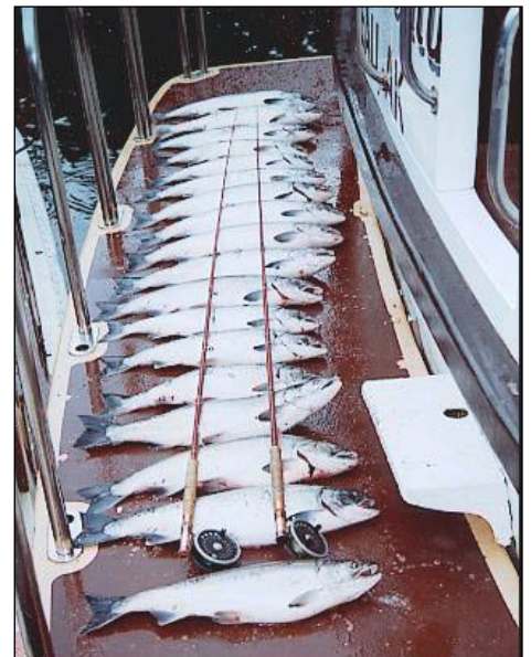
Nice catch of Silver Salmon