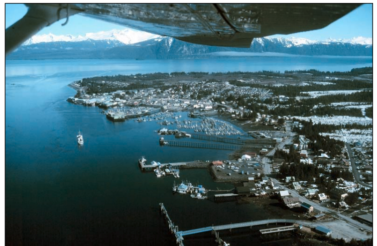
ASA's home port of Petersburg from the air