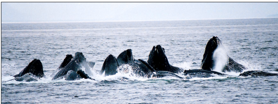
"Bubble net feeding" Humpback whales