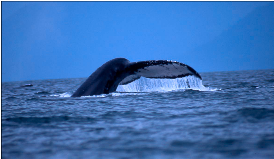
Whale tail from sea kayak

trackless land and cerulean water studded with misty islands. The region is filled with remote estuaries and river systems embraced by towering peaks and glacially carved mountain spires. But it is also a coastal temperate rain forest, with pronounced rains and formidable weather. Weather that has given the island's their unique character and history. Weather that feeds its lush forests, cascading waterfalls and crystalline rivers and creeks. But this weather can also ground air traffic for days and sometimes for weeks. Fortunately this land of islands offers a unique way to see and enjoy the countless natural splendors and in particular, it's world class fly-fishing, and that's by mother ship.