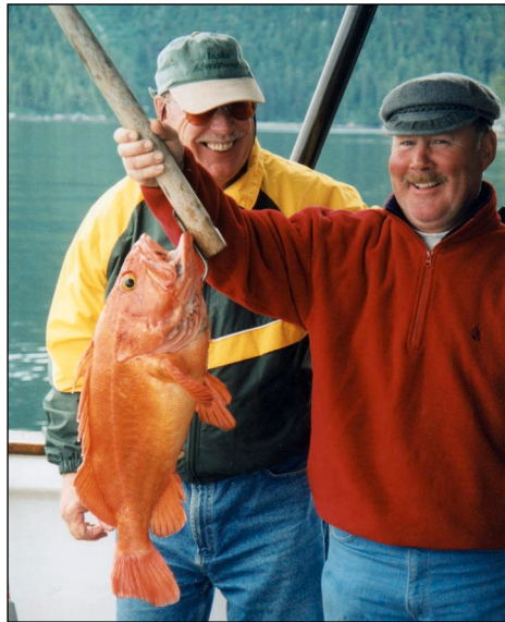
Fresh red snapper for dinner!

The wilderness islands of Southeast Alaska are known for their natural beauty, spectacular glacial spires that tumble to the sea and an abundance of wildlife. What the region is not known for is a surplus of fishing lodges that offer reliable fly-out fishing opportunities. In Southeast Alaska it is the weather and precipitous terrain that not only dictates how one travels but also and probably more importantly, if and when one gets to travel. Although the floatplane is widely recognized (and accepted) as the universal method of Alaskan transportation particularly in the bush, such means of transportation might not always be the viable choice for fishing trips