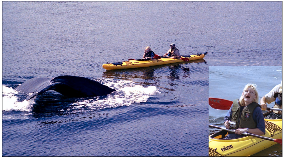
Up real close and personal with a humpback!