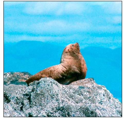
Majestic Steller sealion bull

Southeast Alaska is a fly fisher's paradise. A brilliant tapestry of