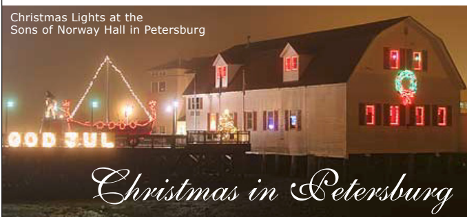
Christmas Lights at the Sons of Norway Hall in Petersburg

Enjoy, and I Wish you the Very Best for the New Year!